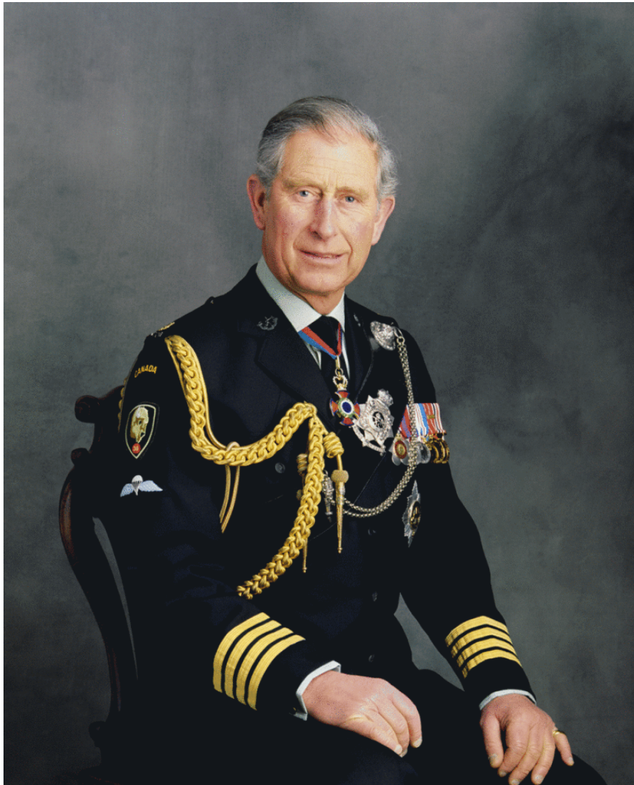
Field Marshal, His Royal Highness Prince Charles Philip Arthur George, Prince of Wales, KG, KT, GCB, OM, AK, QSO, CD, PC, ADC(P)

The primary role of a Colonel-in-Chief is to maintain a link between a Regiment and the British Royal Family. While it is true that a Regiment may request someone other than a member of the Royal Family to become their Colonel-in-Chief, the position is most often held by various members of the extended Royal Family, most often for life.